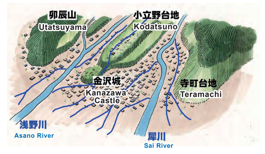
Figure Kanazawa's Landscape

Kanazawa experiences the changes of four distinct seasons, and as part of the Sea of Japan climatic region, is one of Japan's wettest areas. The Tsushima Current that flows along the Sea of Japan gives the region a milder winter than other regions on the same latitude, while at the same time, the northwestern seasonal winds carry water vapor that eventually falls as snow. Winters are dominated by cloudy skies with little sunshine during the day, facilitating the accumulation of wet and heavy snow. The city is bordered by the Sea of Japan on the west, and the Mount Haku range on the east. With this terrain in the background, Kanazawa's old urban district has a diverse structure, with three hills (Utatsuyama, Kodatsuno, Teramachi) and two rivers (Asano River, Sai River).