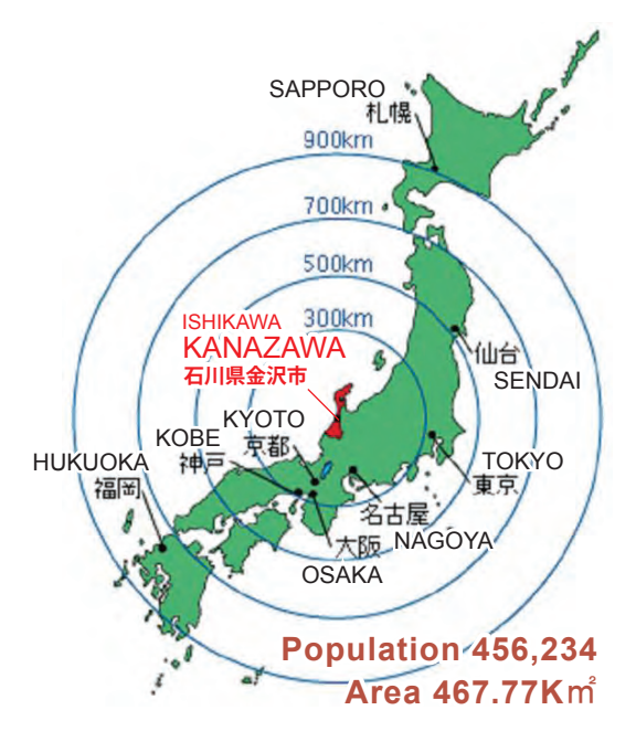
Location of Kanazawa

From ancient times, the interchange of people, goods, and information with China, Korea, and Siberia on the Asian mainland has thrived in this region, which also benefits from its excellent natural environment, resulting in the development of a rich and distinctive culture. Moreover, from medieval to modern times, Kanazawa has actively engaged in scholastic culture and economic exchange, etc., with Kyoto, the former capital of Japan, and Edo (currently Tokyo), and has prospered as the largest city in the Sea of Japan's coastal region.