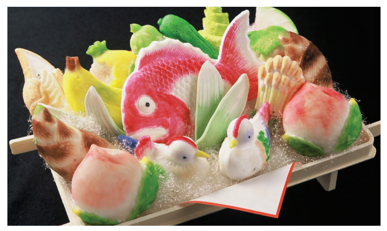
Traditional Japanese Confectionary