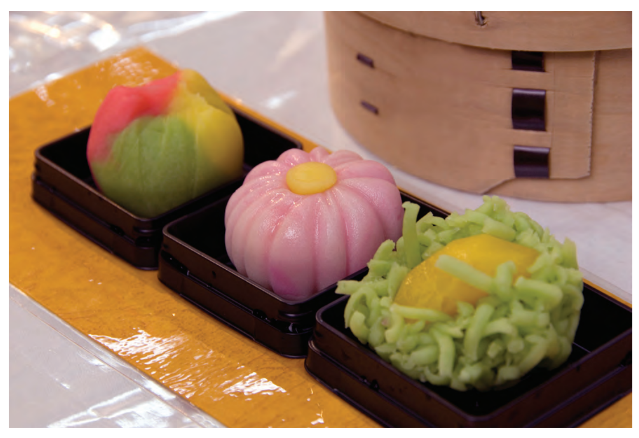
Traditional Japanese Confectionary

Positioning the "cultural mode of production" in Kanazawa anew in its historical development, in a sense, it can be viewed as a resurrection and rebuilding of the craftwork production that began in the Edo Period. The contemporary cultural mode of production (new craft production) that was rebuilt after the transition from medieval craft production to mass production resulting from the industrial revolution, is truly one characteristic of Kanazawa as a Creative City, in that it was built on the development of the "craftwork production system" that was fostered from the Edo Period on.