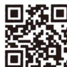
Kanazawa Nursery School Navigation