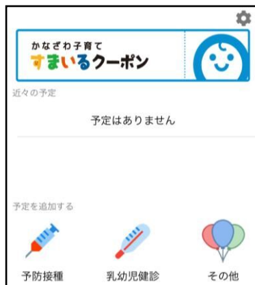
App home screen