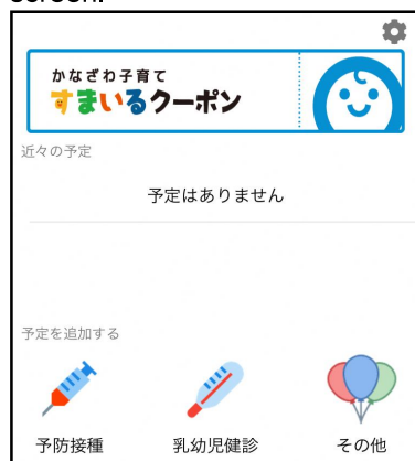
App home screen